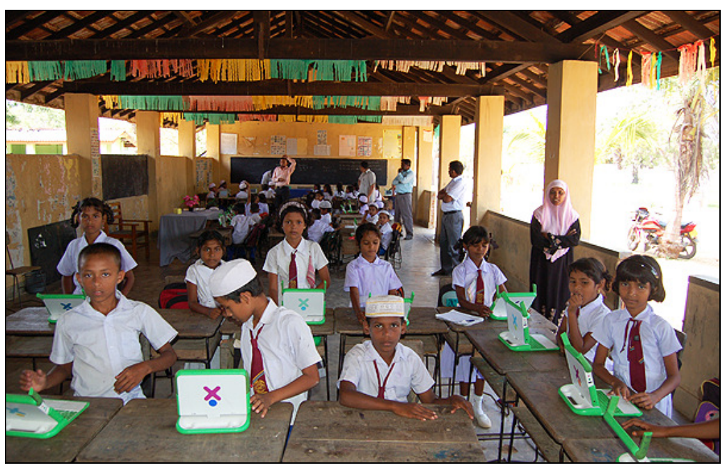
Figure1. Teaching session in the Palmunai OLPC School