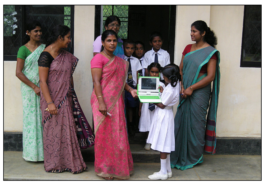
Figure 2 .The Blackwood OLPC School Teacher Team

Our recommendation is that this pilot project should be extended but that the focus should remain on poor schools in non urban areas. To be able to use the new technology without getting stuck in technical problems we recommend further user training that should include parents as well. An improved software and hardware support would also facilitate and the same goes for Internet access and online sharing of learning objects. A common online learning object repository has earlier been discussed but never implemented.