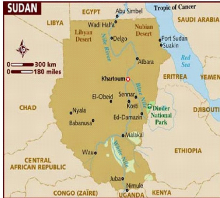
Figure 2. Map of Sudan

table conditions on the fringes of the basin, and in the central part of the basin where the mudstone layer is 16 m. The groundwater movement is from the north to the south and southeast, with a velocity ranging from 1.0 m per year in the southern part of the basin, to 25 m per year in the central and southern parts. The exploitation of the basin for irrigation purposes is being developing, due to the deep water levels.